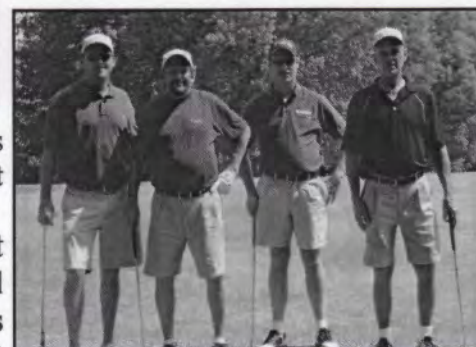
Wadesboro Tire & Auto Team Players

this event and continually seek ways to improve the "Premiere Golf Event of the Year."