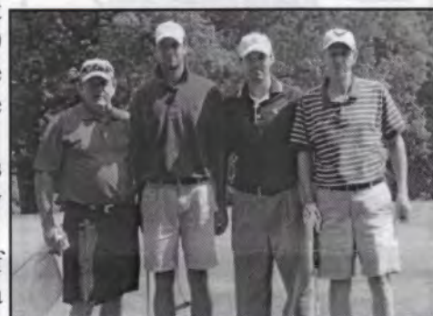
Hornwood, Inc. Team Players