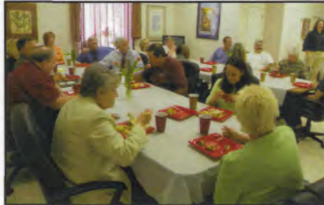
Pictured: Lunch and Learn Attendees