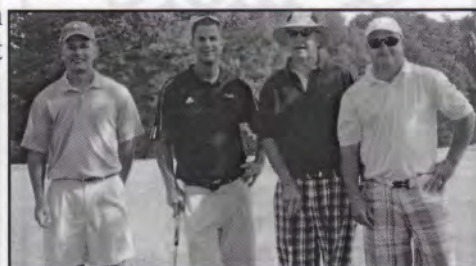
LT's Convenient Store, LLC Team Players