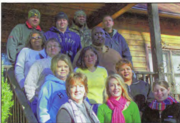
The 2010 Leadership Anson Class members.