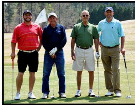
1st Place - Wadesboro Tire & Auto

The Anson County Chamber of Commerce held its 14 th annual "Chamber Open," better known as the "Premier Golf Event of Anson County" on Friday April 11 th at Twin Valley Country Club. With 34 teams booked and many volunteers lined up everyone was prepared for a great tournament. Players had their choice of an 8:00am or 1:00pm tee time and with weather looking very nice, it was sure to be a great day for golf!