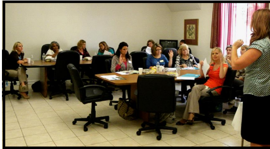
Attendees of the Lunch & Learn

If there is a topic you would like to learn more about, please contact the Chamber of Commerce at 704-694-4181 and we will bring it to you in the near future.