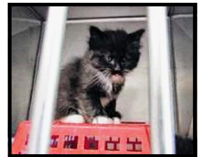
Article Courtesy of The Anson Record

For more information, or to make donations, visit the Anson County Animal Shelter at 7257 U.S. 74 West, Polkton, or call 704-994-APET.