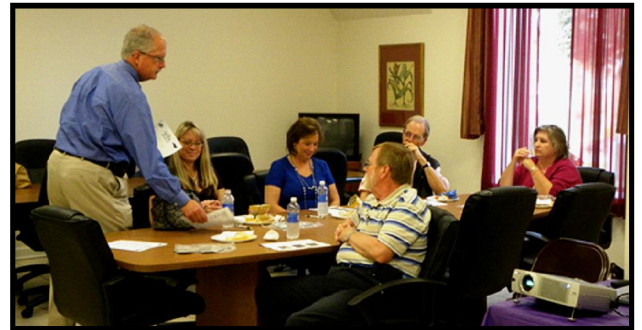
Attendees of the Lunch & Learn

The attendees learned of the five generations. The Traditionalists who were born before 1945, Baby Boomers who were born between 1946 and 1964, Generation Xers who were born between 1965 and 1979, Generation Y or the Millennials who were born between 1980 and 2000 and Generation Z or the iGeneration born after 2000. There are 44 million Traditionalists in the workplace today, along with 77 million Baby Boomers, 49 million Generation Xers and 75 million Generation Yers. One topic discussed was how the generations view work hours. Traditionalists believe that you should work until the job is done or the boss says to go home. Baby Boomers tend to work all the time, and they often come in early and stay late. Generation Xers work hard to complete a project, but if they are not needed, they want to have the freedom to leave. And Generation Y views work as something to do between the weekends or other interests.