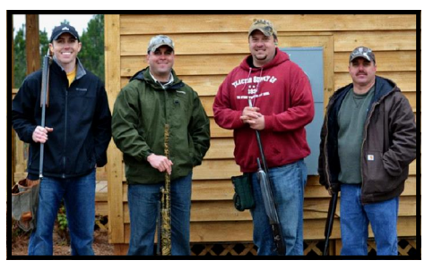
3rd Place Team -Covington Optometric Eve Clinic