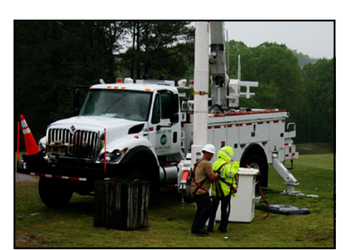
Thanks to Pee Dee Electric!

There are many others to thank for their contributions to this event with goodie bag items, team and hole sign sponsorships. A special thank you to