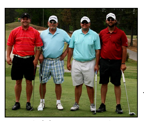
2nd Place: Tyson Team #2