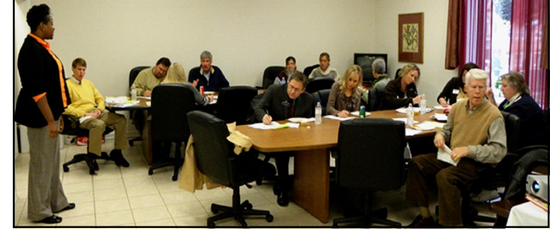
Attendees of the Lunch & Learn

The Chamber and SPCC Small Business Center have planned another Lunch & Learn for March 19<sup>th</sup>. If there is a topic you would like to learn more about, please contact the Chamber of Commerce at 704-694-4181 and we will bring it to you in the near future.