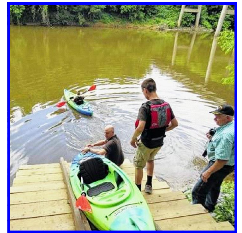
Article Courtesy of The Anson Record

To learn more about the Carolina Thread Trail, visit www.carolinathreadtrail.org .