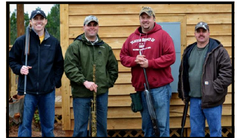
3 rd Place Team -Covington Optometric Eye Clinic