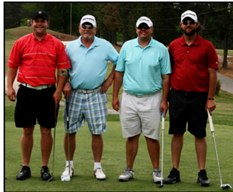
2nd Place: Tyson Team #2