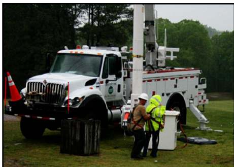
Thanks to Pee Dee Electric!