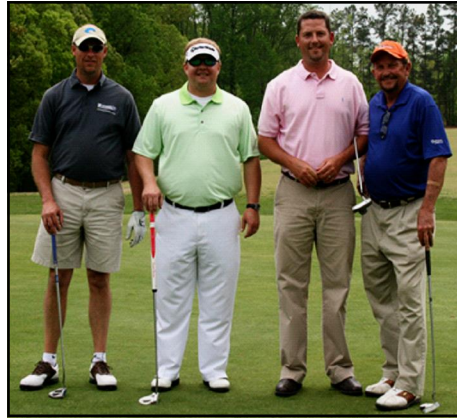
1st Place: Wadesboro Tire and Auto Team

There are many others to thank for their contributions to this event with goodie bag items, team and hole sign sponsorships. A special thank you to