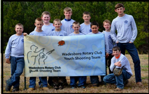
Wadesboro Rotary Club Youth Shooting Team

Buchanan Shoals was a beautiful setting on Saturday, March 23 for the third annual Wadesboro Rotary Club Sporting Clays Competition. Despite morning downpours, by start time the sun was shining and the 36 competitors enjoyed beautiful weather and a great event. Proceeds totaled nearly $4000 and will be used to support the Rotary Youth Shooting Team and other community projects. A big thank you to this year's sponsors Anson Bank & Trust, Anson Family Optometric, Covington Optometric Eye Clinic, Classic Graphics, Hornwood, Pee Dee Electric, Kiker Resource Management, LKC Engineering, Lynn Thomas Grading, and R.E. Burns & Sons, Inc.