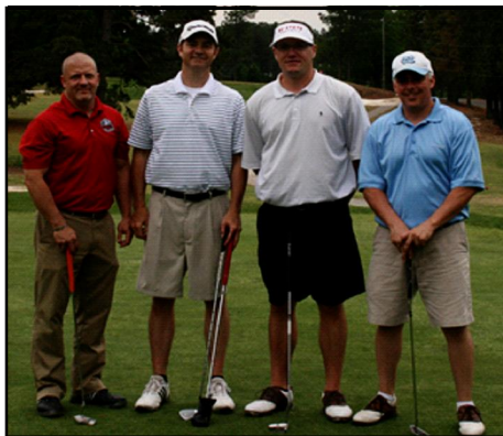
3rd Place: BB&T Team