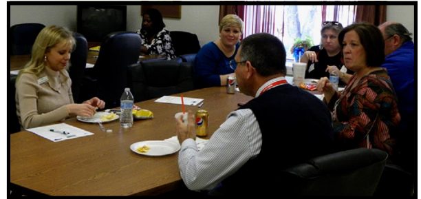
Attendees of the Lunch & Learn