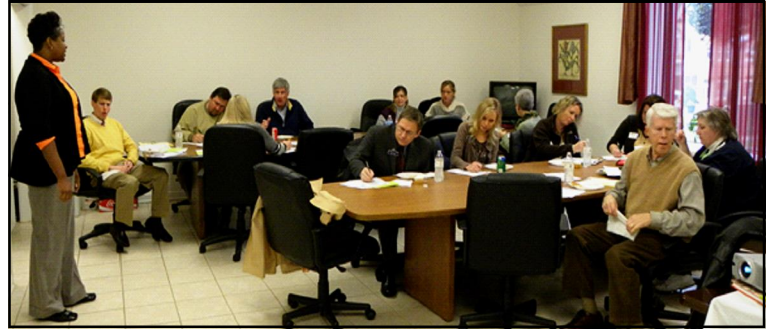
Attendees of the Lunch & Learn

The Chamber and SPCC's Small Business Center have planned another Lunch & Learn for March 19 th . If there is a topic you would like to learn more about, please contact the Chamber of Commerce at 704-694-4181 and we will bring it to you in the near future.